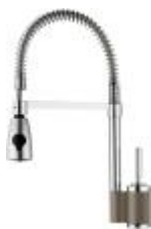
BLANCO MAESTRO II