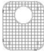
Stainless Steel Sink Grid 406388