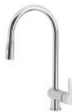
BLANCO RITA DUAL SPRAY