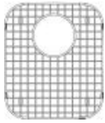
Stainless Steel Sink Grid 406387