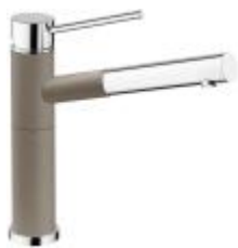
BLANCO ALTA DUAL SPRAY